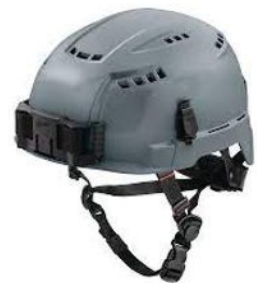
Fig. 2: Construction helmet

Helmets are designed with advanced impact-absorbing materials like high-density foam and polycarbonate shells, which provide enhanced protection against head injuries. This advancement is particularly crucial in industries where workers face high-impact risks, such as professional athletes and military personnel and now, construction crews (Fig. 2).