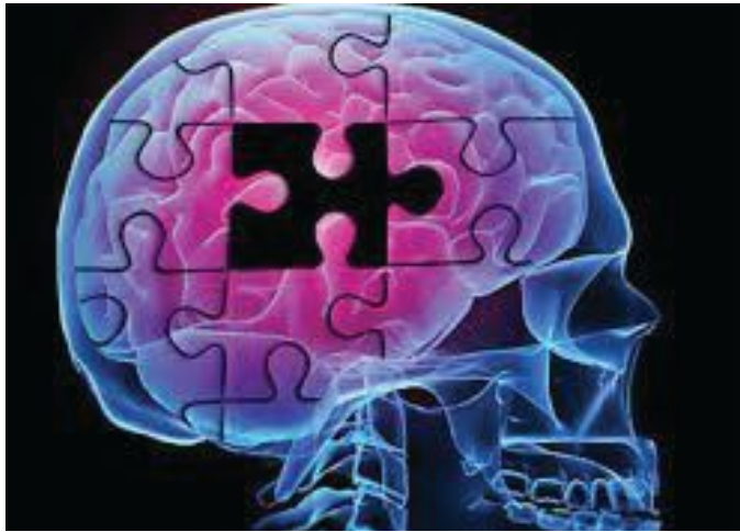
Fig. 3: Traumatic brain injury

Traumatic brain injury (Fig. 3) remains a significant concern in various industries, especially those where high-impact accidents are more likely, such as construction. The transition to helmets has brought significant improvements in TBI protection through: