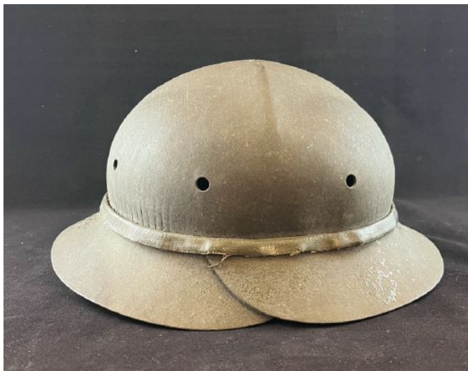
Fig. 1: Hard Boiled® Hat

Hard hats made from leather, canvas, or steel first made their appearance in the early 20th century. The first hard hat, patented in 1919, was called the “Hard Boiled® Hat” (Fig. 1) because of the steam used in the manufacturing process. The first designated “Hard Hat Area” enforced with the threat of dismissal was set up at the San Francisco Golden Gate Bridge construction site. 1 Hard hats were primarily used in the construction industry to protect workers from falling debris and head injuries. Over time, hard hats became more standardized and began to include suspension systems for added comfort and impact absorption. The iconic design, with a protective brim and a solid crown, became a symbol of safety in construction sites worldwide.