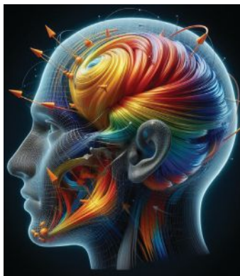
Fig. 4: Rotational impact

Rotational impact, often overlooked, is also a critical factor in head injuries (Fig. 4). It occurs when the head is subjected to both linear and rotational forces during an impact, causing strain and damage to the brain. The traditional hard hat design was not effective in addressing these rotational forces, leading to concerns about brain injuries.