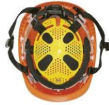
Fig. 6: MIPS