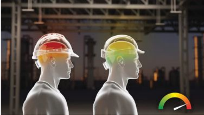
Fig. 5: Thermal gradients of hardhats compared to helmets

Manufacturers and testing labs are currently evaluating heat effects with an eye toward better understanding actual vs. perceived heat retention differences between hard hats and helmets. This information will help dispel myths and misunderstandings and, in some cases, may lead to modifications to the helmet designs.